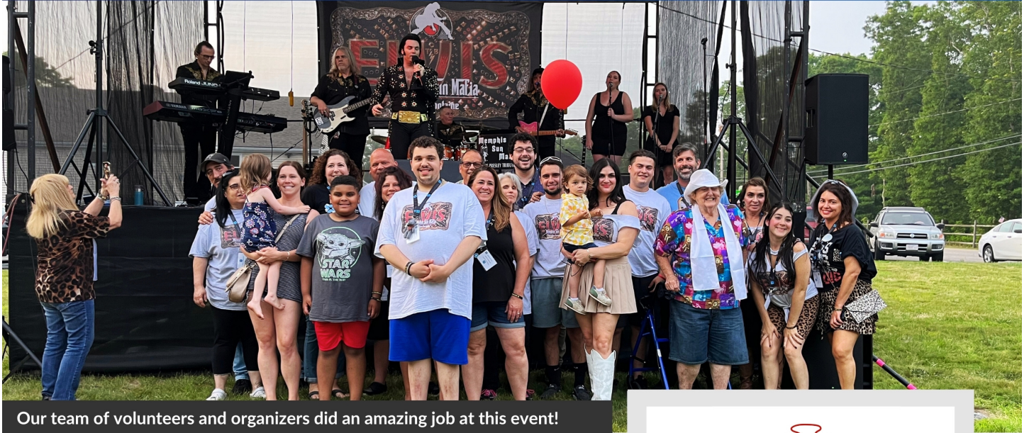
Our team of volunteers and organizers did an amazing job at this event!